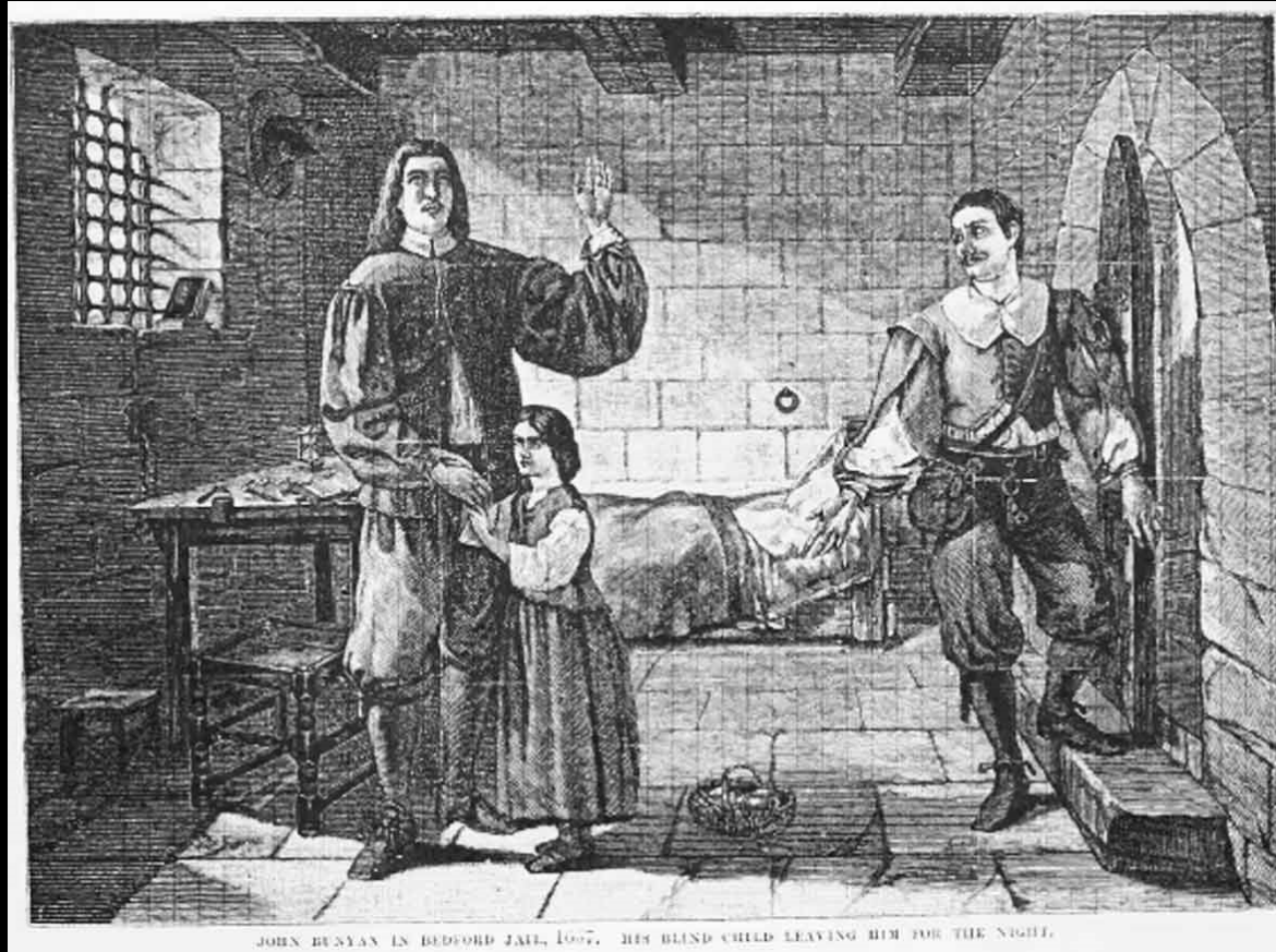
JOHN BUNYAN IN BEDFORD JAIL, 1667. HIS BLIND CHILD LEAVING HIM FOR THE NIGHT.